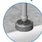
CONNECTION TO PCJ ON-LINE DRIPPER