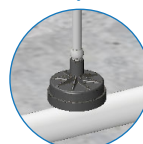
CONNECTION TO PC ON-LINE DRIPPER