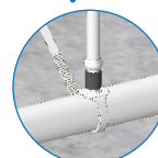
CONNECTION TO UNIRAM™